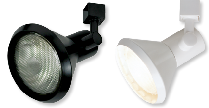
NTH-126B Black Cone